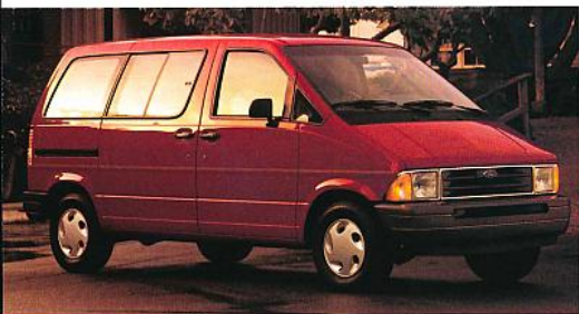
Above: Aerostar XL in Ruby Red Clearcoat Metallic.