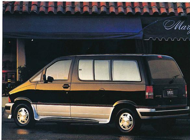
Above: Extended-length Aerostar XLT in Bimini Blue Clearcoat Metallic.

Left: Aerostar XL in Raven Black with the optional Sport Appearance Package, which includes silver metallic bumper/lower body side paint and other features (see the back cover for complete package contents).