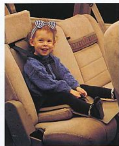
Aerostar offers optional integrated child safety seats.