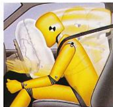
Some equipment shown on these pages may be optional.

With Aerostar, you have a wide range of choices. Seating for 5 or 7 passengers, regular- or extended-length models, 2-wheel drive or the extra traction of the optional electronic 4-wheel-drive system.