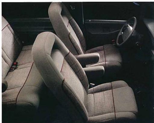
Above: Aerostar XLT interior in Medium Grey. Standard 7-passenger seating features dual front captain's chairs with power lumbar adjustment and map pockets and 2- and 3-passenger rear bench seats.